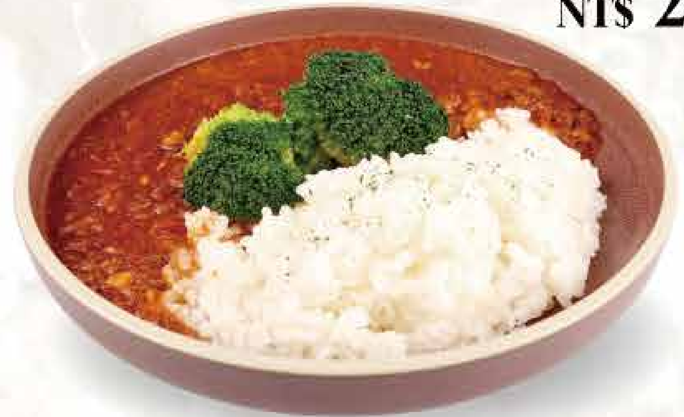
波隆那番茄肉醬飯 Bolognese Sauce Rice NTS 280