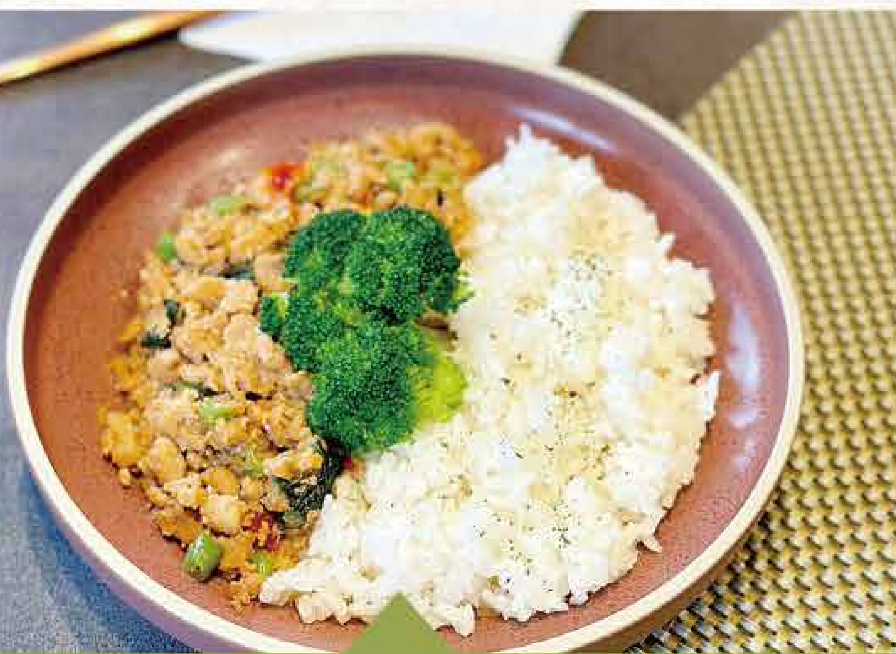
塔香打拋豬飯 Stir-Fried Minced Pork with Holy Basil Rice NTS 280