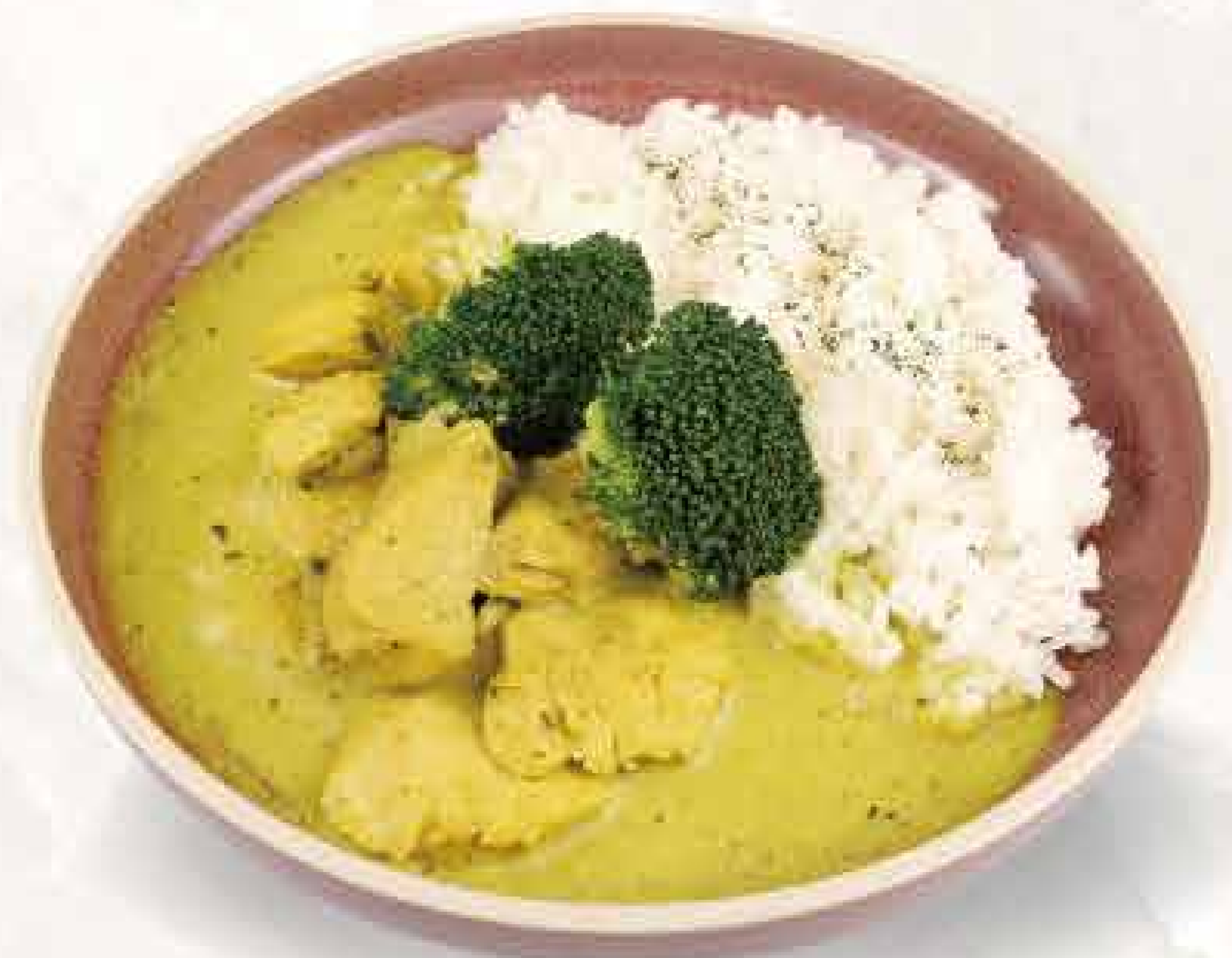
泰式綠咖哩雞飯 Thai Green Curry Chicken Rice NTS 280

食材依季節變化而調整，實品以現場為主，圖片僅供參考。 詳細資訊請洽服務人員。消費加收10%服務費