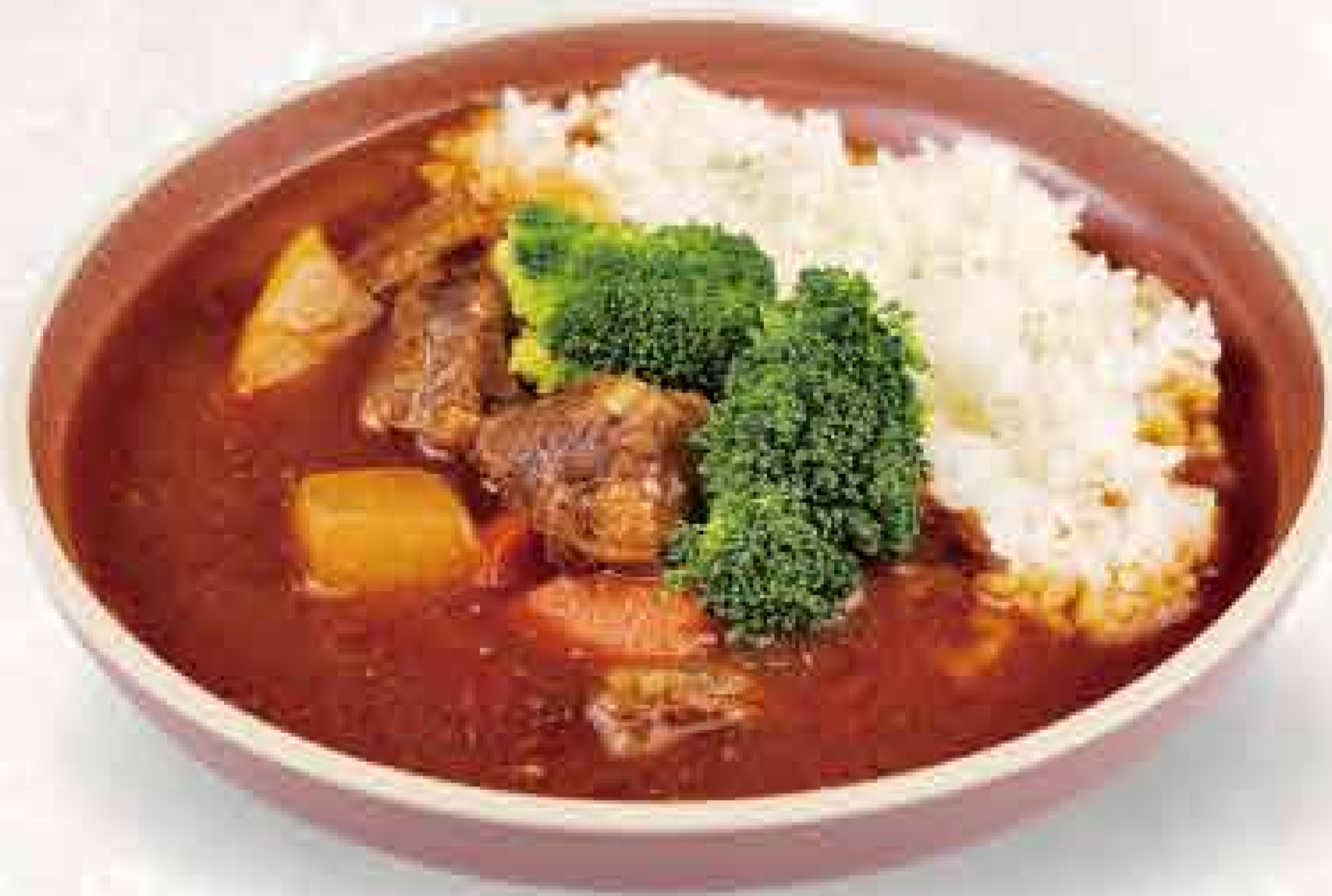
紅燒牛腩飯 Braised Beef Brisket Rice NTS 280