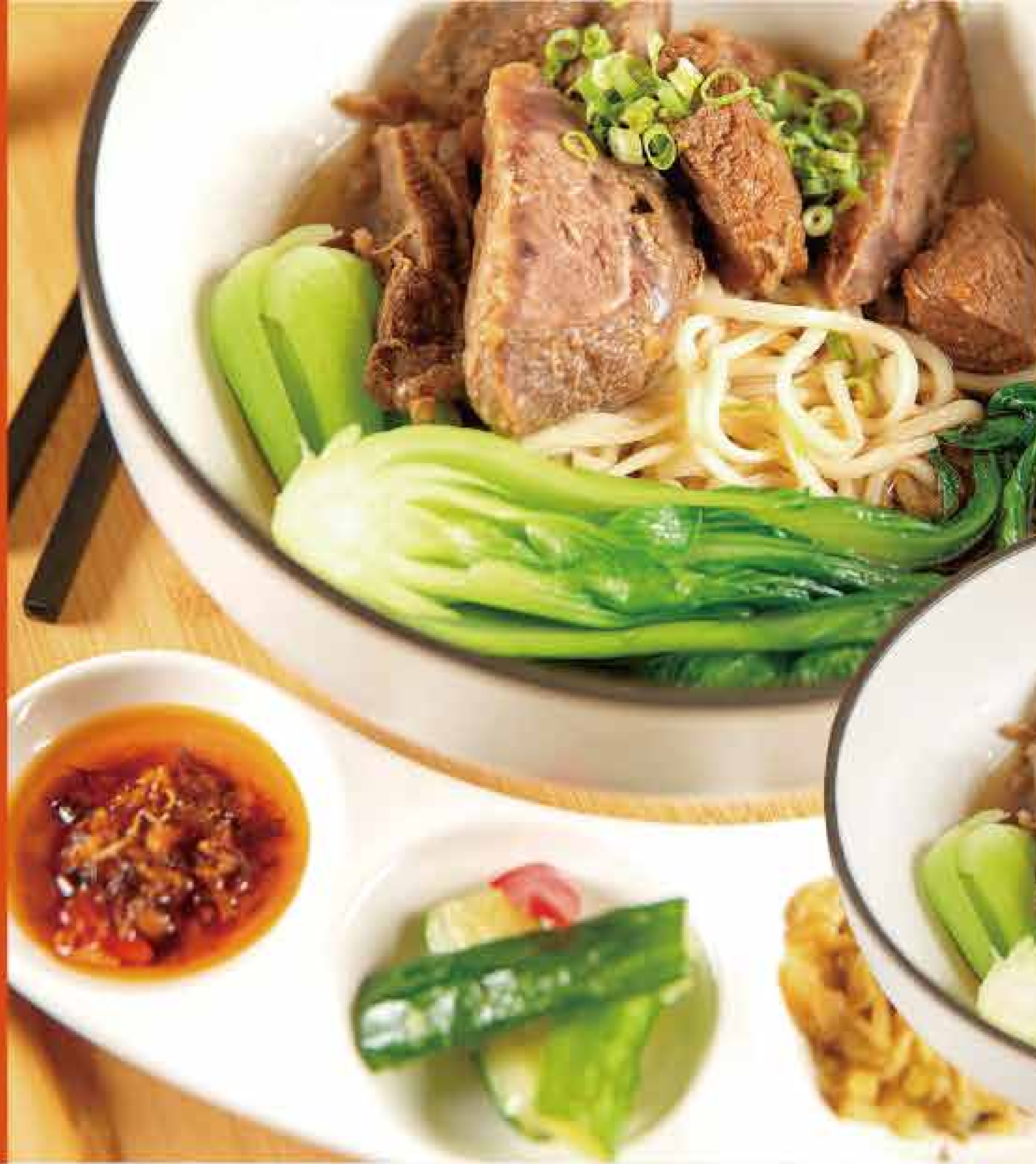
牛肋條牛肉麵 Classic Taiwanese Style Beef Noodles NTS 430